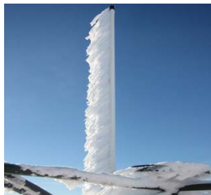
Marine antennas operate in a punishing environment of corrosive salt, extreme movement and, sometimes, freezing spray. Yet they must deliver top performance 24/7.

Since the U.S. government limits VHF transmission power to 25 Watts, you have